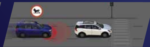
AUTOMATIC EMERGENCY BRAKING