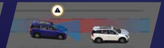
LANE KEEP ASSIST