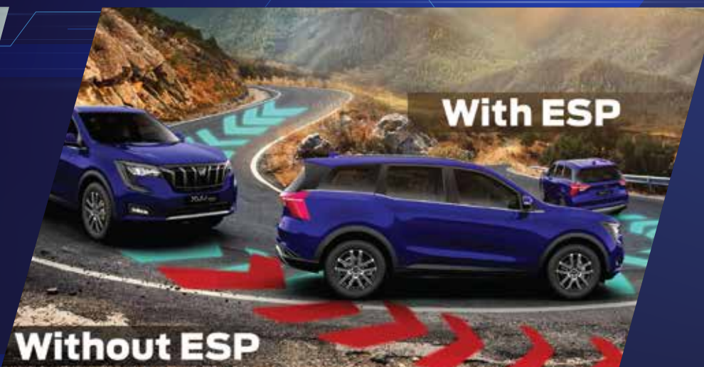
LATEST-GEN ELECTRONIC STABILITY PROGRAM