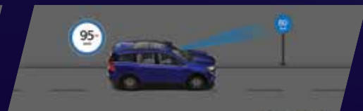
TRAFFIC SIGN RECOGNITION