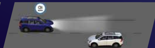
HIGH BEAM ASSIST