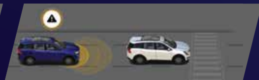
FORWARD COLLISION WARNING